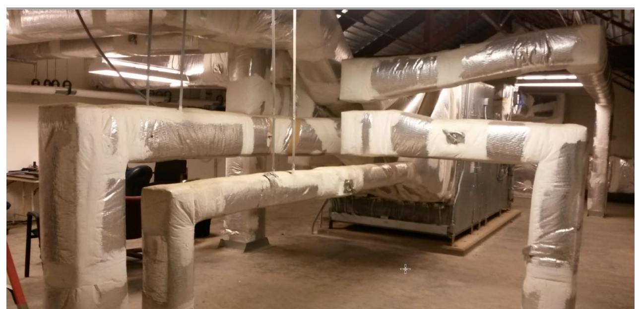
Multizone air handlers mix a zone specific air temperature for each zone, which has its own dedicated duct