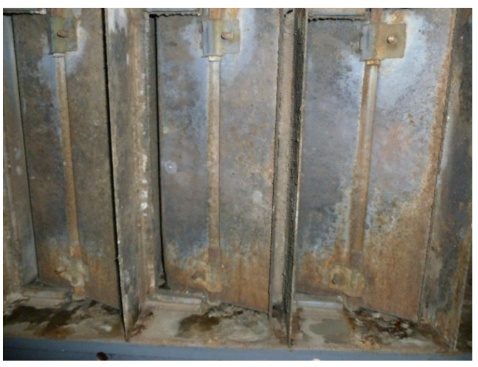
Rusty damper blades still work in 40-year-old unit.